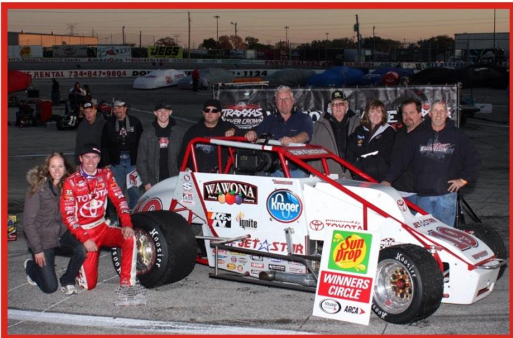
Victory Lane: Team 6R Racing enjoys the Winner's Circle after setting a New Track Record and leading all 150 laps at Toledo!